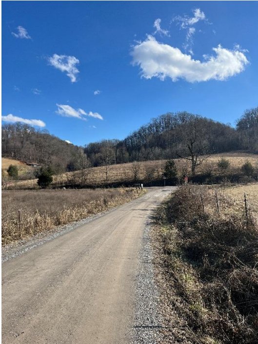
Smith Hollow Lane